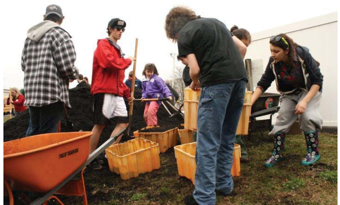
Service Work with The Food Project